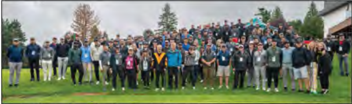
A total of 144 golfers raised $101,500 for Archway Community Services during the recent sixth annual charity golf tournament at Ledgeview Golf Club. (Submitted photo)